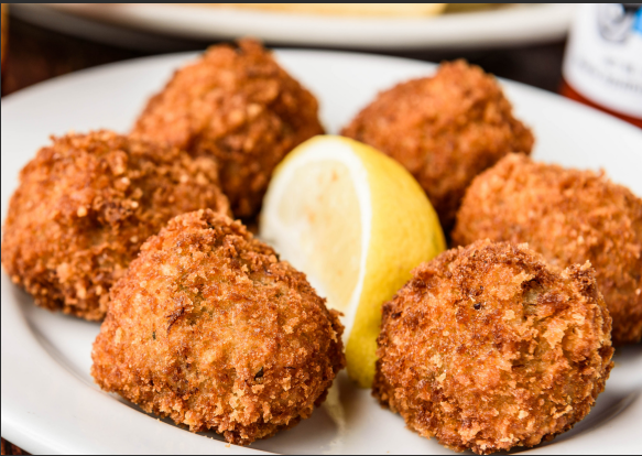
Crab Cake Minis

Toasted French bread topped with crawfish cheese spread