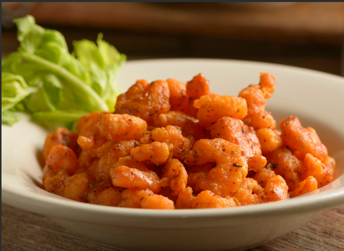
Bayou Blazin' Shrimp