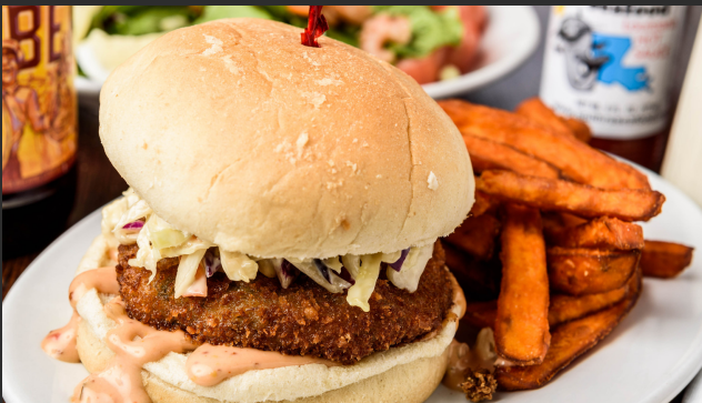
Crab Cake on Bun