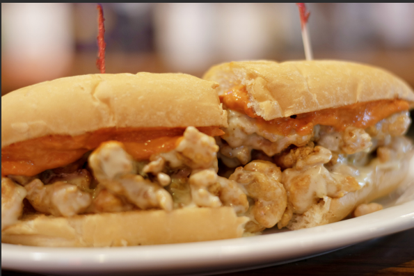
Crawfish Pepper Jack