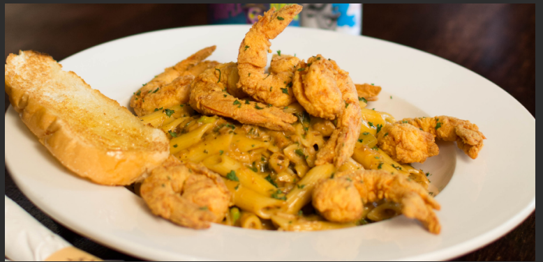
Voodoo Bayou Pasta